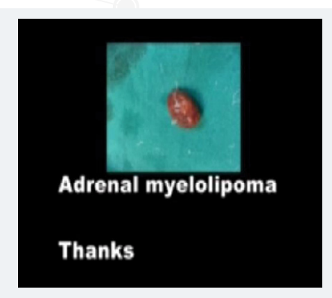
Figure 5: The adrenal myelolipoma.