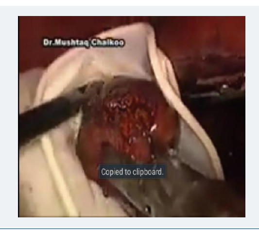
Figure 4: The encapsulated tumour.