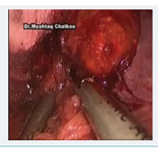
Figure 3: Posteriomedial dissection.

adrenal vein is identified its divided. Dissection of the gland is subsequently carried out with care taken at the medial aspect where the wall of the IVC closely approximates the adrenal. The adrenal may extend posterior to the cava and this dissection is completed by following the wall of the cava and gentle medial retraction of the IVC. Once the medial dissection is completed, the lateral dissection is performed just as described for the left adrenalectomy. Once complete mobilization is accomplished and hemostasis is achieved, the specimen is removed with the EndoPouch (Figures 4,5 and 6).