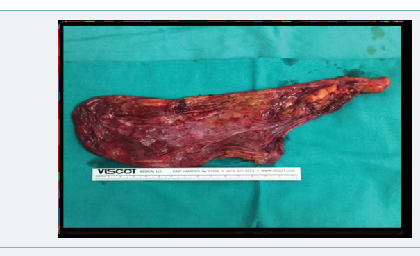
Figure 3: Hernial sac resection.

The Morgagni hernia is a diaphragmatic hernia which, like hiatal hernia, almost always has a peritoneal sac, unlike other diaphragmatic hernias such as the Bochdalek or those caused by traumatic breakage of the diaphragm. Its transverse diameter is